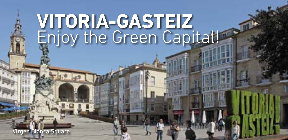
Virgen Blanca Square

V itoria-Gasteiz is surprising by nature. It is one of the European cities with the largest surface area of green spaces to walk, run or cycle in, to birdwatch or go horse riding. The 'European Green Capital 2012' award, its status as a certified Sustainable Tourist Destination (2016) and the 'Global Green City 2019' award acknowledge it as one of the most environmentally-committed cities at international level. Discover it!