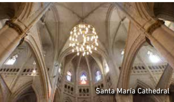
Santa María Cathedral

eras. This is the case of Santa María Cathedral or the Old Cathedral (13th century) and the Medieval Wall (11th century), both essential visits. Not to forget its churches and Renaissance palaces such as Villa Suso , Montehermoso and Escoriaza-Esquivel .