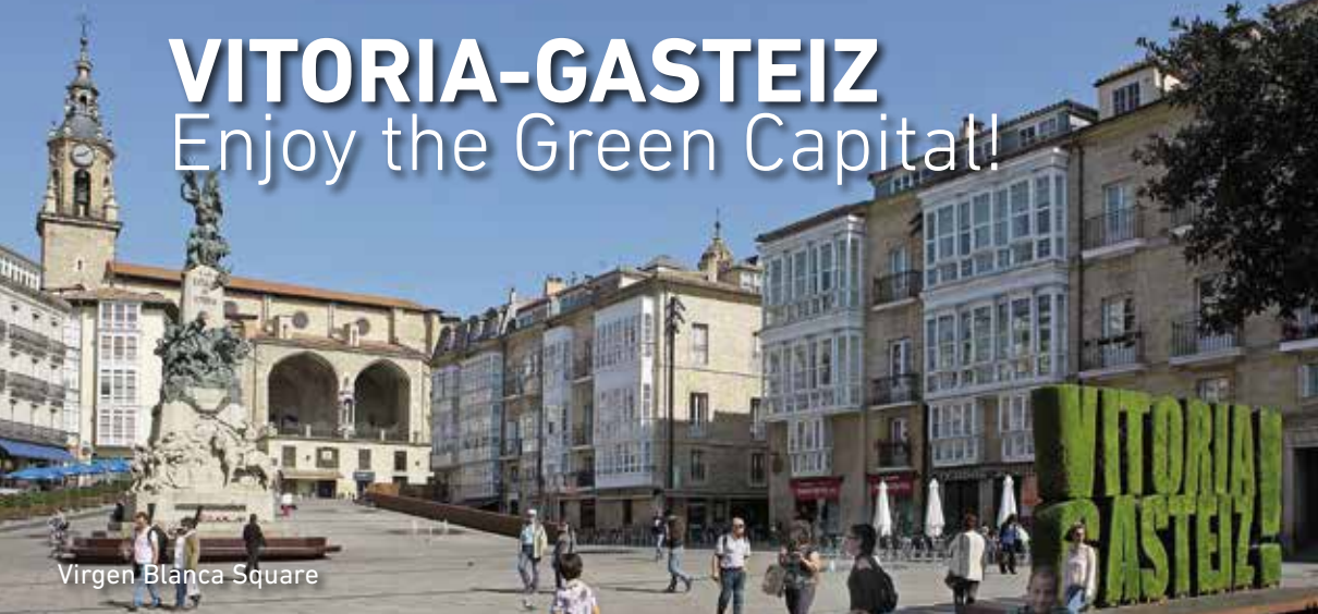
Virgen Blanca Square

V itoria-Gasteiz is surprising by nature. It is one of the European cities with the largest surface area of green spaces to walk, run or cycle in, to birdwatch or go horse riding. The 'European Green Capital 2012' award, its status as a certified Sustainable Tourist Destination (2016) and the 'Global Green City 2019' award acknowledge it as one of the most environmentally-committed cities at international level. Discover it!